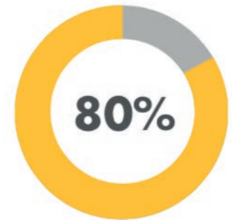
Satisfaction with staff safety in iOR

0.8 man hours per case increased productivity by surgical staff with devices that are quickly and easily controlled