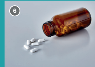
6 Grey worktop shows up medication