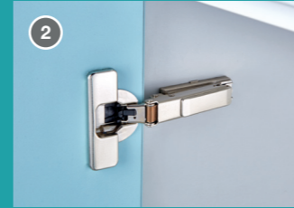
2 Easy-clean heavy-duty hinges