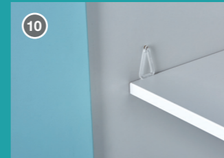
10 Anti-tip shelves