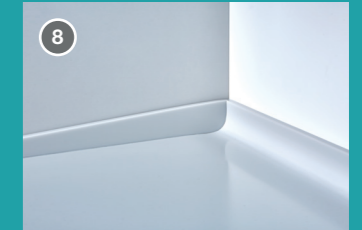
8 Seamless rear upstand