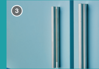
3 Easy-wipe handles