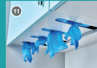
11 Built-in glove dispenser