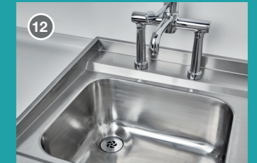
12 Clinical stainless steel sinks