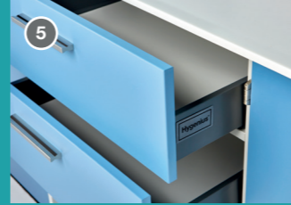
5 Easy-clean enclosed drawer runners