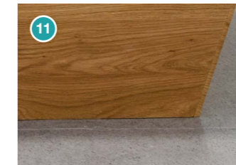
11 Fitted bed secured to the ground reduces damage risk