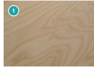
1 Robust 25mm plywood specification