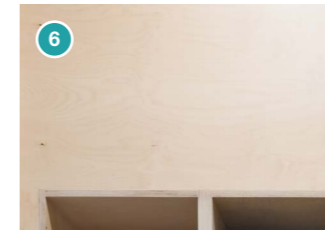
6 Optional secure, lockable storage above cupboard