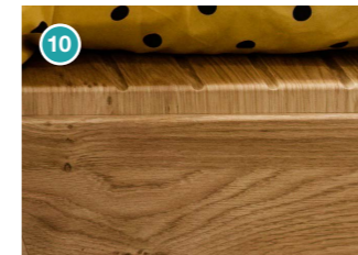
10 Routed grooves on bed base to allow air circulation