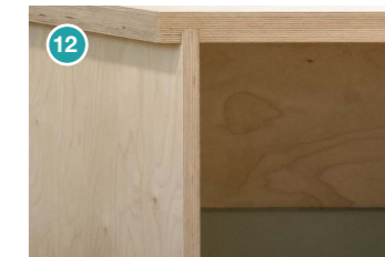
12 ABS edging matched to laminates