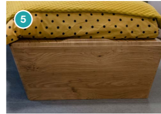
5 Below bed storage option