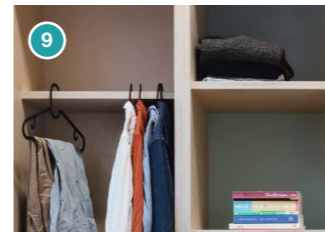
9 No doors on storage