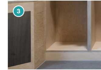
3 Modular design for increased robustness and easy install