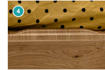
4 Mattress support