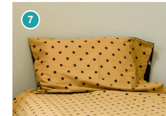
7 Optional fitted headboard to reduce risk