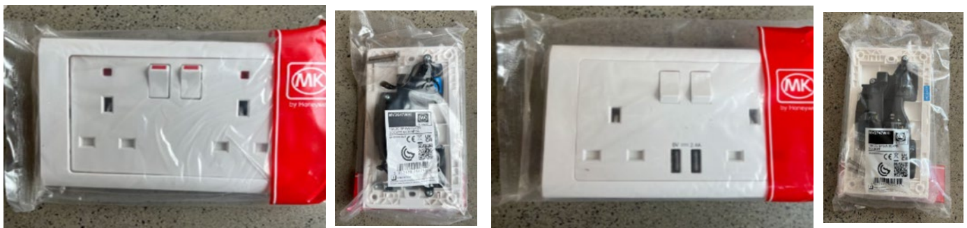
Sample images sourced from Office of Product Safety and Standards (OPSS) product safety report (2411-0130)